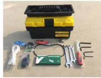
Feeding & Notching Parts